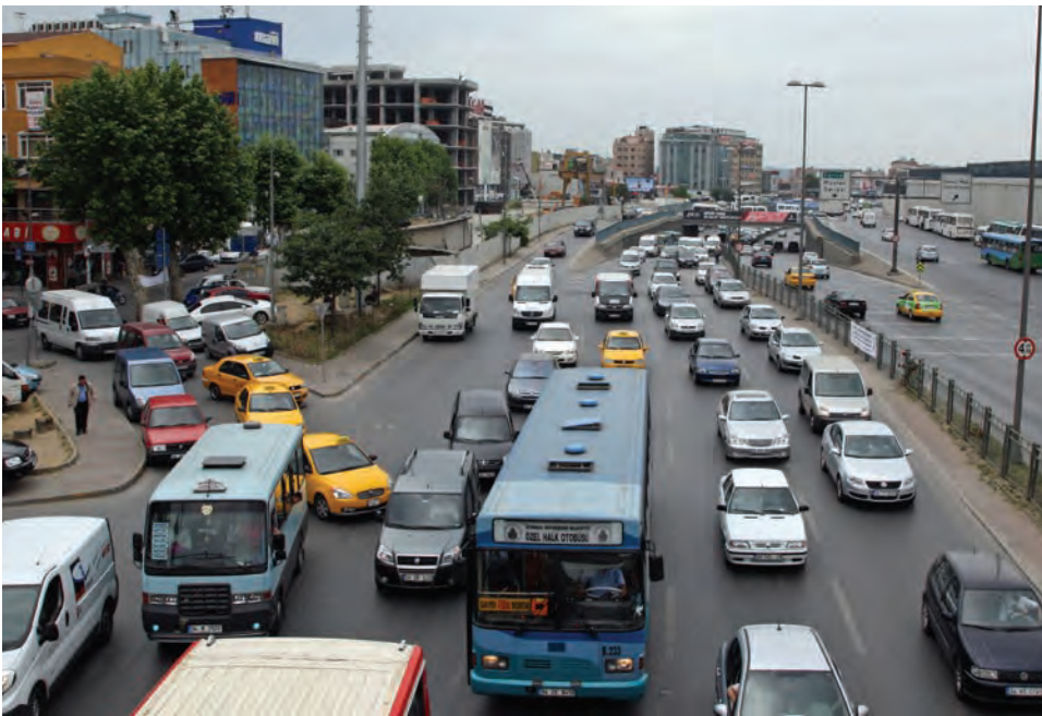
Figure 1 | Traffic Snarls

The most important factor contributing to the above problems has been the rapid increase in the use of private motor vehicles. For instance, in the six largest cities in India, the population doubled between 1981 and 2001, but the number of motor vehicles increased eight times over the same period. Between 2000 and 2013, car ownership in China increased more than six times. Similar trends are seen in other fast growing economies. Increased income levels and the availability of cheaper personal vehicles, coupled with increased travel distances and inadequate public transport systems, have made the personal motorcar an increasingly attractive travel option.